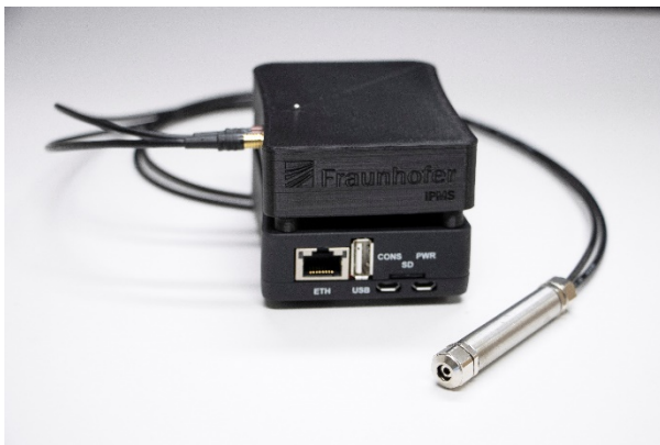
Evaluation kit as a test setup of miniaturized capacitive micromechanical ultrasonic transducers (CMUTS)