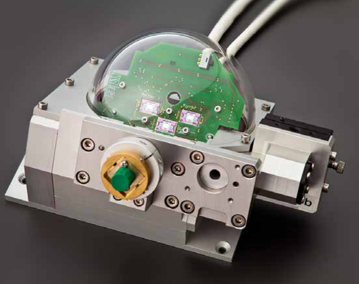
Optical scan head of a 3D-TOF camera with integrated MEMS scanning mirror array.